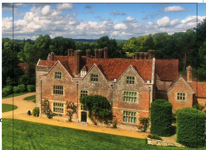
Chawton House, beloved by Jane Austen